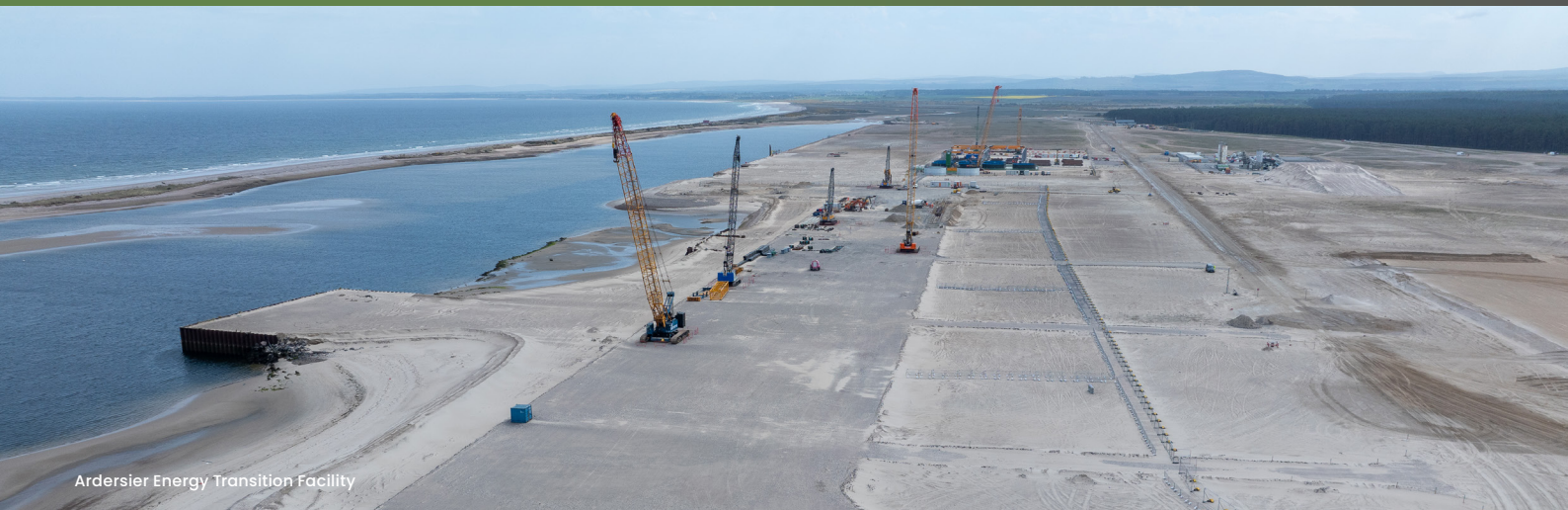
Ardersier Energy Transition Facility

Stay up to date with the latest developments at greenfreeport.scot